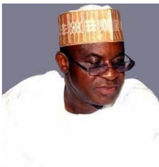
Senate President, David Mark

THE National Assembly symbolises the sovereignty of Nigerian people. There are two chambers in the National Assembly which comprise of the House of Representatives and the Senate. There are 360 members in the House of Representatives with 109 Senators in the National Assembly. Altogether, there are 469 legislators. Each member of the National Assembly is entitled to 5 Legislative Aides, notably, Senior Legislative aide who should be a Lawyer, a Legislative aide, a Personal Assistant, a Secretary and an Office Attendant or a Messenger. A Senior Legislative aide earns 250 thousand naira per month while a Legislative aide and a Personal Assistant earn 70 thousand naira each per month. The aides are trained twice yearly and paid 120 thousand naira. They are also paid duty, transport and other allowances quarterly as extra. They are paid 50 thousand naira extra for feeding during training.